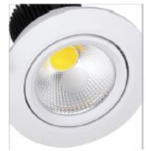
Middle-frosted Glass White