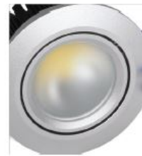
Frosted Glass Silver