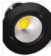
Clear Glass Black

Lens cover: Clear, Frosted, Centre frosted